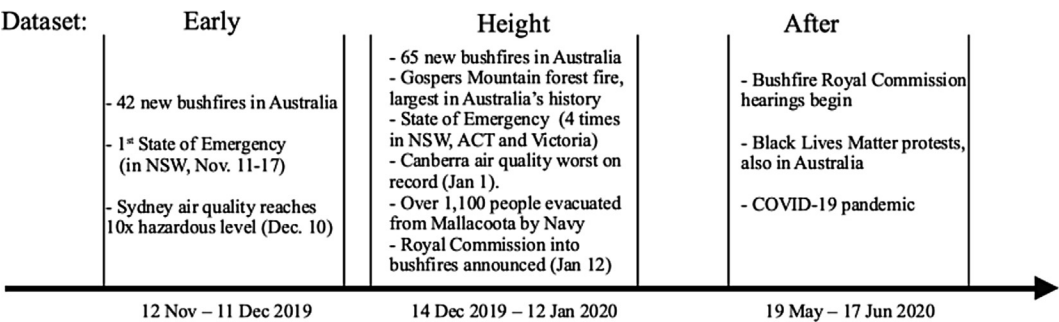
Fig. 1. Key events for each dataset.

In this view, then, discursive legitimization relates to how discourses legitimise (support) or de-legitimise (undermine) the legitimacy of discourses and the actors involved in them. On a very general level, salient discourses may establish the legitimacy of topics for public discussion and debate. On a more specific level, salient discourses may (de)legitimise specific existing discourses tied to the external crisis event, including those that establish or deny causal links between the bushfires and climate change. To be clear, we approach discursive legitimization as a theoretical lens through which to (partially) interpret our results, rather than as an analytical framework for discourse analysis. Further, we consider